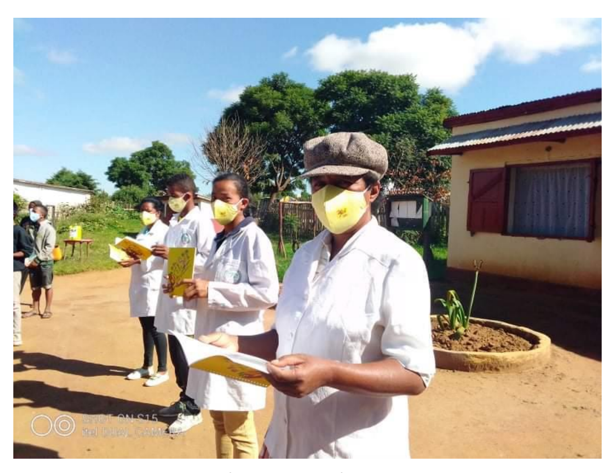
These teachers have got materials from the district office, together with the newly printed second edition of the teacher's guide with games for children, Mihisa.

distribute to the schools, but the number of face masks and other materials is by far not enough to cover all teachers and students in the district. The schools also don't have proper hand washing facilities.