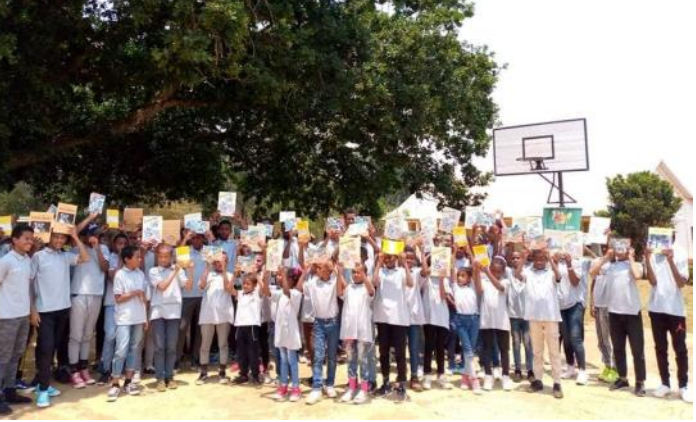
During the distrubition of books in Ambatolampy