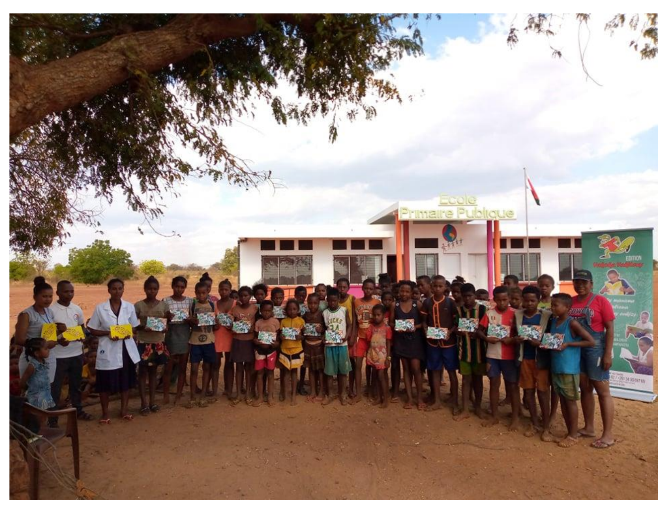
The students and teachers in front of their new school, and with their new books